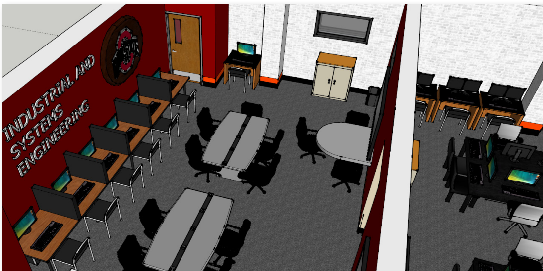
Illustration shows the suggested redesign of the ISE computer lab space. A group study lab is on the left, while individual stations are located in the "quiet" lab room at right.

"I know the lounge is important to me and I had nothing to do with it," she says. "The lounge brought our department closer together and I think this lab will continue to do that."